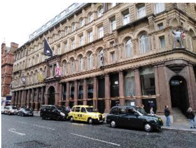
Hard Day's Night Hotel, with Beatles adorning the first floor.

Apart from statues of the Beatles themselves, there was also quite a lot about them in or near Mathew Street, the primary one being the Cavern Club in Mathew Street, the site of the Beatles first significant gig.