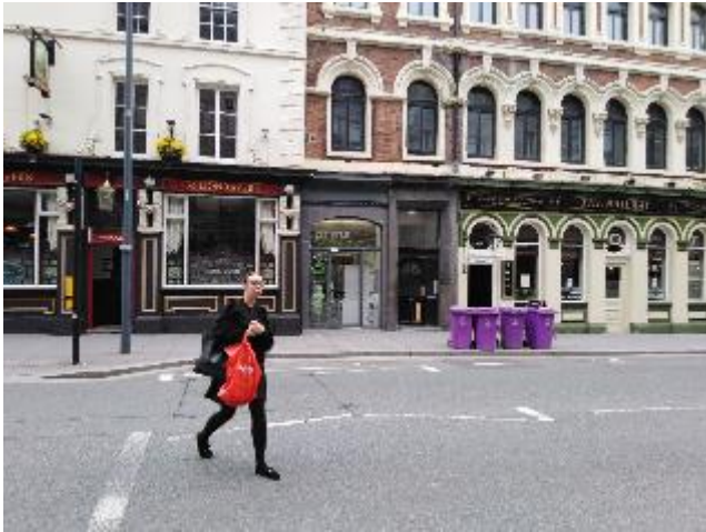
A camouflaged laundromat.