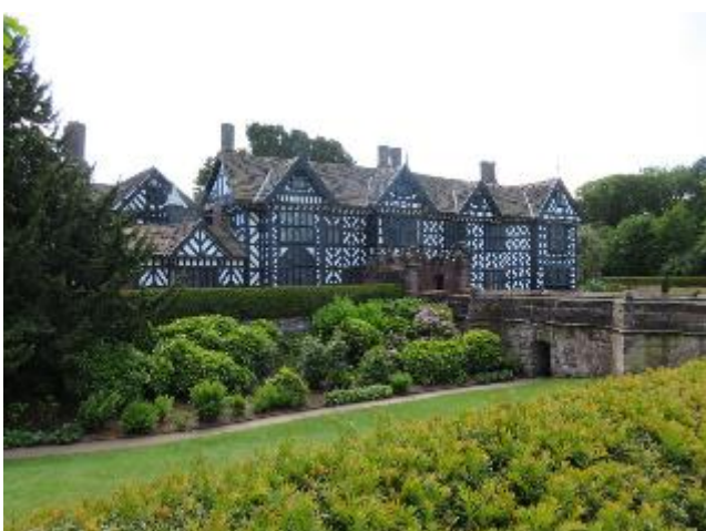
Speke Hall, Liverpool.