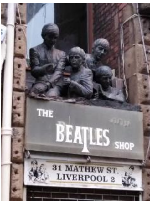
The Beatles looking down on Mathew Street.