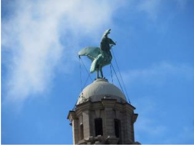
A Liver Bird, atop the Royal Liver Building; note the ties to stop it flying away!