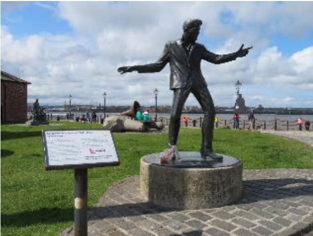
Statue of Billy Fury on the Wharf.