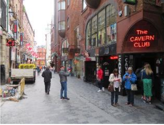
Mathew Street, and the entrance to the Cavern Club.