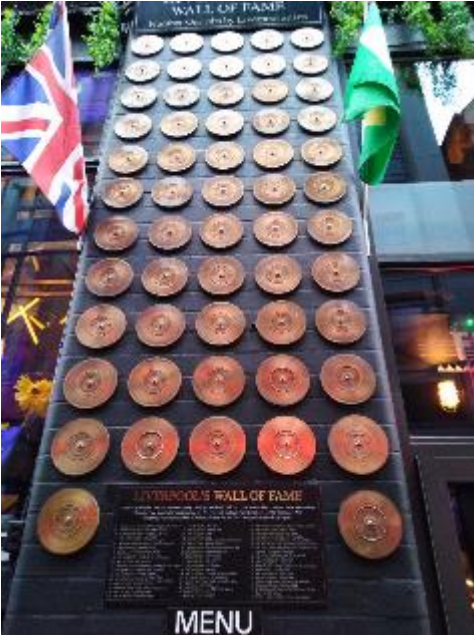
Liverpool's Wall of Fame (in Mathew Street): #1 hits by Liverpool artists.