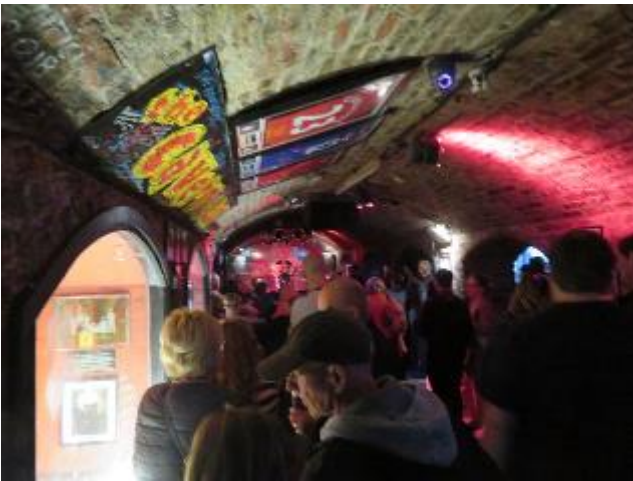
The Cavern Club, surprisingly deep down under the street, with a band playing Beatles songs!