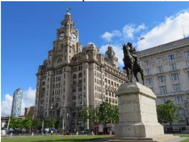
Royal Liver Building, and statue of King Edward VII.

Of course, there are other sights in Liverpool, but we had seen many of them before. But I did want to check out the Royal Liver Building – as it happened, across the road from our hotel. Amongst its tenants is the Universities Superannuation Scheme, who monthly pay me my modest UK-based pension.