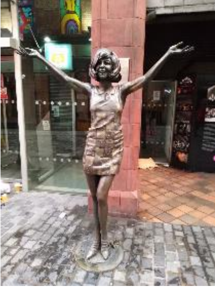
Statue of Cilla Black in Mathew Street.