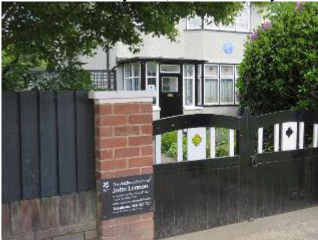
John Lennon's childhood home.

The above sights were all within walking distance of our hotel, but I had planned a drive to some more far-flung locations, including the childhood homes of John and Paul, Penny Lane (including the shelter in the middle of Penny Lane), and Strawberry Field.