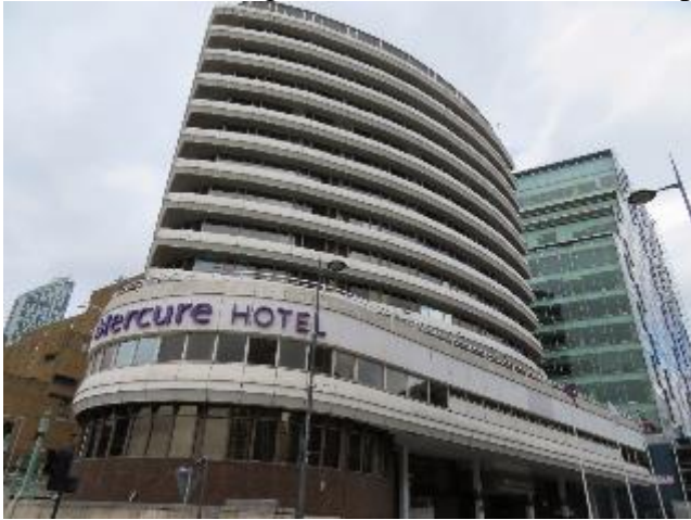
Liverpool Mercure Hotel.