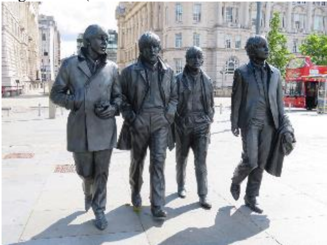
The Beatles (larger than life size) on the Wharf in Liverpool.

Having dealt with the washing, it was time to check out some of the Beatles/Fab-4 sights, which included a great group statue on the Wharf, John Lennon lounging against a wall in Mathew Street, a cluster above a doorway also in Mathew Street, and just around the corner in North John Street atop the Hard Day's Night Hotel (which has not connection with the Beatles, other than the name).