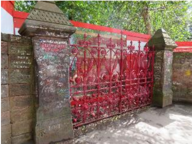
Strawberry Field: a children's home run by the Salvation Army, now being redeveloped, at which time the grounds will be opened to the public.

Since we were out in the Eastern part of Liverpool, we drove the short distance to the 16thC National Trust property, Speke Hall, quite eye-catching, and some lovely grounds/gardens.