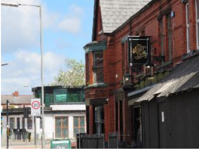
The end of Penny Lane, including (in the background) the shelter featuring in the song, now Sgt Pepper's Bistrot.