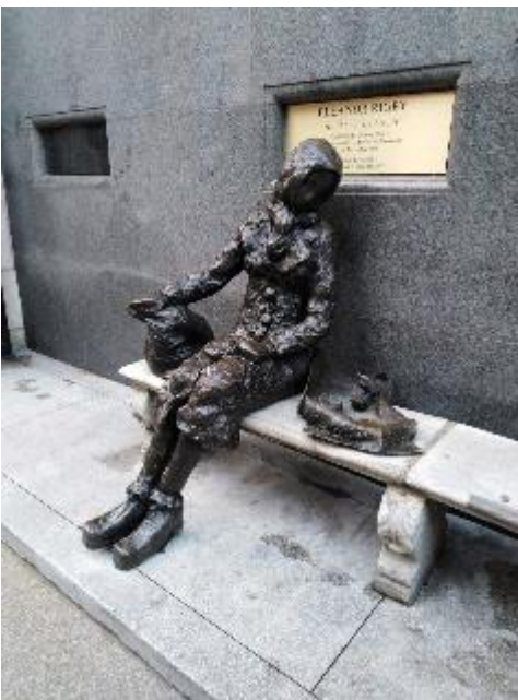
Eleanor Rigby statue near Mathew Street.

Capitalising on the fame that the Beatles have brought to the city, Liverpool is quick to point out the many other musical greats that have come from Liverpool, like Cilla Black, Billy Fury, Gerry and the Pacemakers, etc.