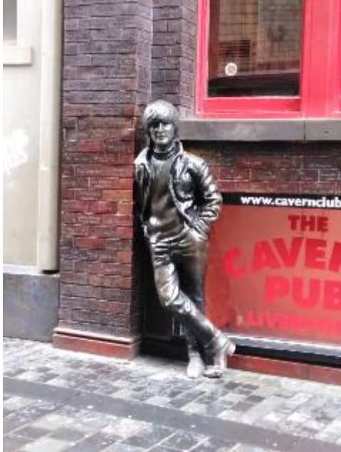
John Lennon, lounging in Mathew Street, outside the Cavern Pub (across the street from The Cave).