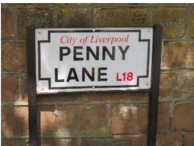
The start of Penny Lane.