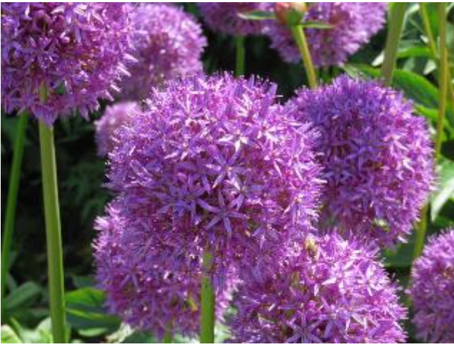
Aliums at Speke Hall.

Return to the Blog home page at http://www.alex-reid.com/Blog/ to see other blogs.