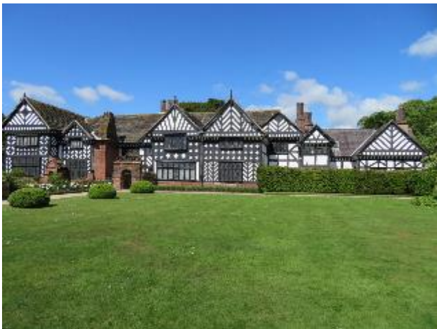
Speke Hall, Liverpool.

Since we were out in the Eastern part of Liverpool, we drove the short distance to the 16thC National Trust property, Speke Hall, quite eye-catching, and some lovely grounds/gardens.