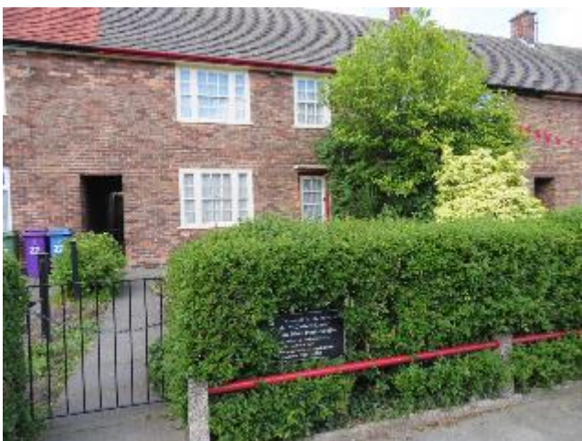
Paul McCartney's childhood home.